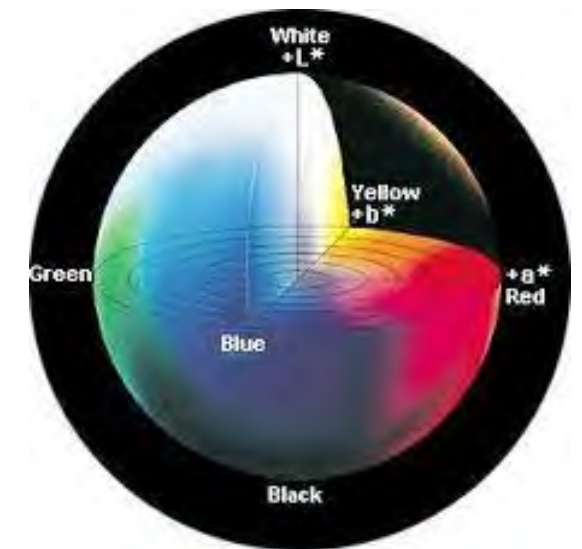
Konica Minolta CIE L*a*b*